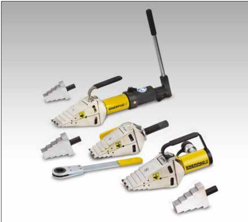
▼ FSC14, FSM8 and FSH14 with safety blocks SB1