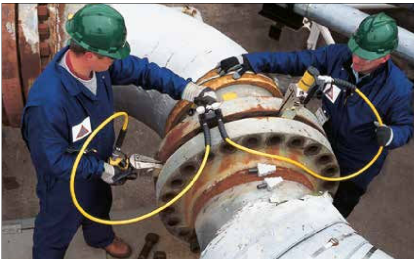
▼ Two FSH14 spreaders used simultaneously with Enerpac handpump, hoses and AM21 control manifold.