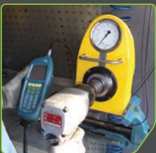
HAVS & Vibration