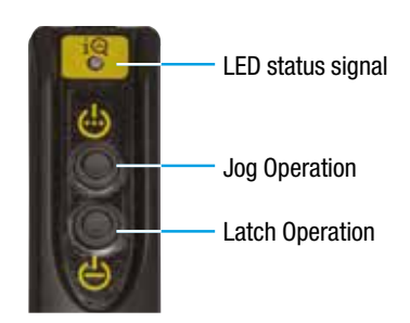
3/2 Jog, 3/2 Dump, 4/3 Jog pendant with 3 metres cord