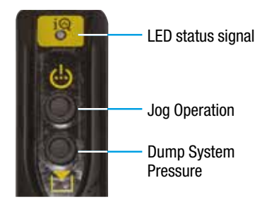
3/2 Dump and Hold pendant with 3 metres cord